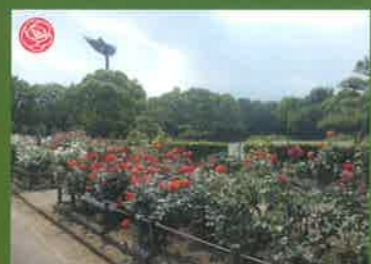
▲ Hiratsuka Sogo Park ③