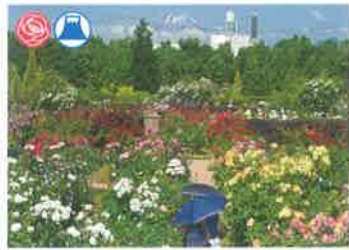
▲ Kana-Garden -Botanical Garden- 8

From the top of the Shonandaira hill, the photogenic 360-degree view of the Shonan waterfront Tanzawa ridges, Mt. Fuji, Mt. Hakone and the Izu Peninsula is significant. The cherry blossom and Azelea viewing in spring, green hiking trails and night scene are popular among the visitors.