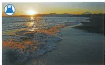
▲ Hiratsuka Beach 11