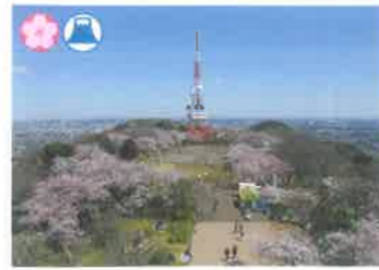
▲ Shonandaira 7

Hiratsuka Museum focuses on the nature and history of the Sagami Bay River basin. It is widely recognized for its public exhibition of the natural history of the Shonan area community.