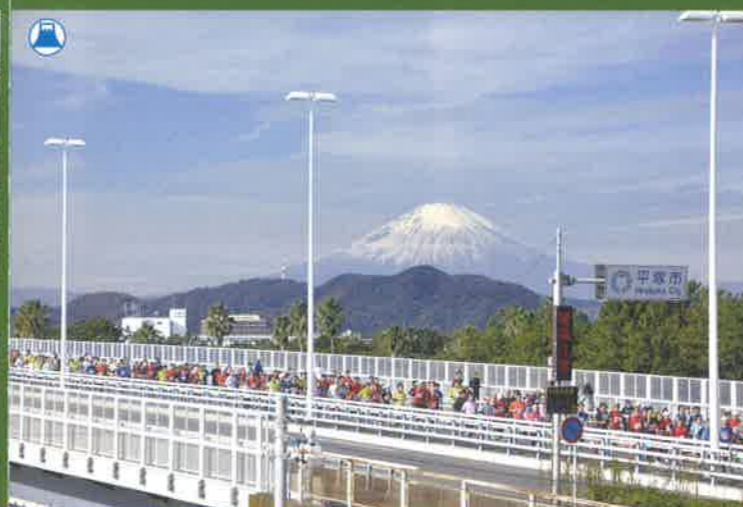
▲ Shonan International Marathon ⑮