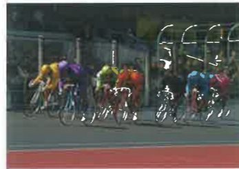
▲ Hiratsuka Keirin -Bicycle Race- 12

The Yokohama Rubber Memorial Hall of Hiratsuka is an European Style building and constructed in the Meiji period(1868-1912). This hall was registered as the National Tangible Cultural Properties in 2004 and are available for conferences and concerts.