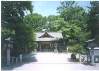
▲▲ Sakitori Shrine 9 / Shonan Ginga Ohashi (Shonan Galaxy Bridge) 10

"Megumi Research & Development Zone" provides an exhibition room, a cooking room and a library etc.