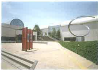
▲ Hiratsuka Museum of Art 4

Hiratsuka museum of art has a magnificent permanent collection of local artists and special exhibitions given several times a year. In addition, it offers the art gallery of citizens, the art information, the workshop for both children and adults.