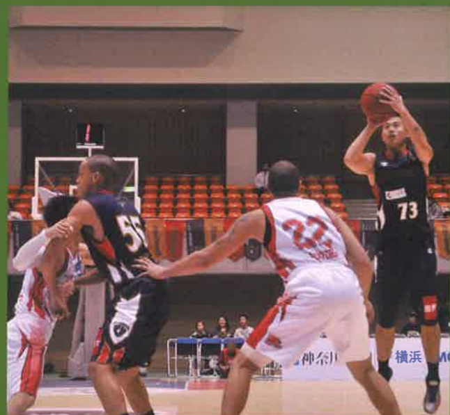
▲ Tokkei Security Hiratsuka General Gymnasium ③