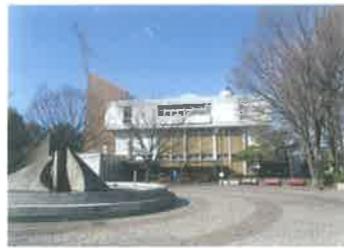
▲ Hiratsuka Museum 5

Hiratsuka museum of art has a magnificent permanent collection of local artists and special exhibitions given several times a year. In addition, it offers the art gallery of citizens, the art information, the workshop for both children and adults.