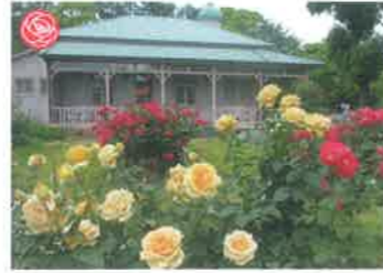
▲ The Yokohama Rubber Memorial Hall of Hiratsuka 6

You can enjoy variety of events and experience classes where children can participate such as accessories workshop, yoga, bicycle, tennis and rugby.