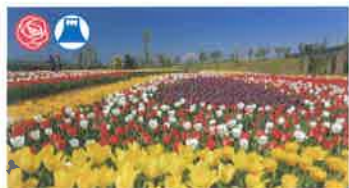
▲ Kana Garden -Botanical Garden- 8

KEIRIN has become an official Olympic event, making it an internationally recognized sport associated with its country of origin, Japan.