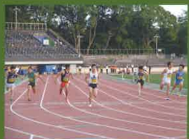
▲ Shonan BMW Stadium Hiratsuka ③