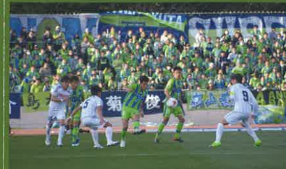
▲ Shonan BMW Stadium Hiratsuka

"Shonan Bellmare" is a professional football club in the Japan Football League. You can enjoy exciting games at the Shonan BMW stadium in the Hiratsuka Sogo Park throughout the year. Bellmare contributes its energy to various professional sports such as beach volleyball, triathlon, futsal, cycle road race and sevens rugby, aiming to participate in the major International events.