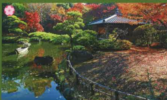
▲ Japanese Garden ③

The Excellent services of the park enhanced the quality of life for the community. There are many facilities such as a baseball stadium, a track and field (soccer) stadium, a Gymnasium, an aquatic center, a zoo and a Japanese garden.