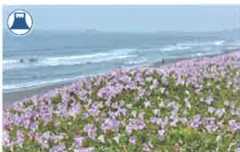
▲ Hiratsuka Beach 16