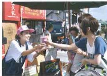
▲ Sun Sun Marche 17

On the second Sunday of each month, Sun Sun Marche is the best place for fun family activities.